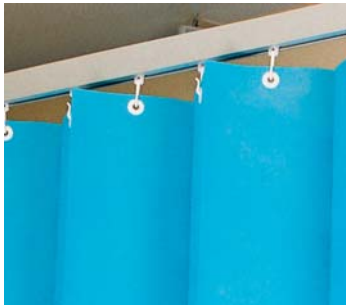
harrier Disposable cubicle curtains