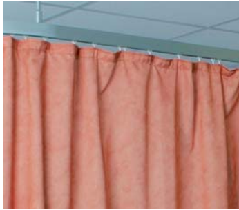
harrier Ready-made cubicle curtains