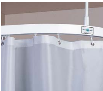
harrier Shower curtains