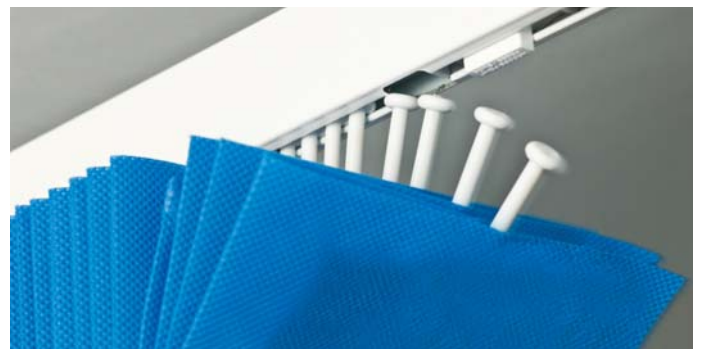
The DPL4 easy load glider system in operation. Where tracks are provided with a curtain removal point, such as shown here on Movatrack or on Vitesse 6200 window track, curtains may be taken down or re-hung extremely quickly, with the integral gliders simply slotting into place.