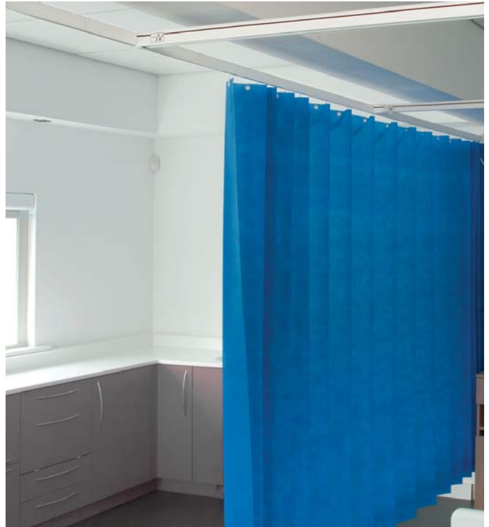
Harrier disposable curtains may be cut down in both width and drop for window openings. The label provides space to enter the date for replacement.

All Harrier products are available through a nationwide network of distributors / customers, with experienced service teams providing an unrivalled level of support.